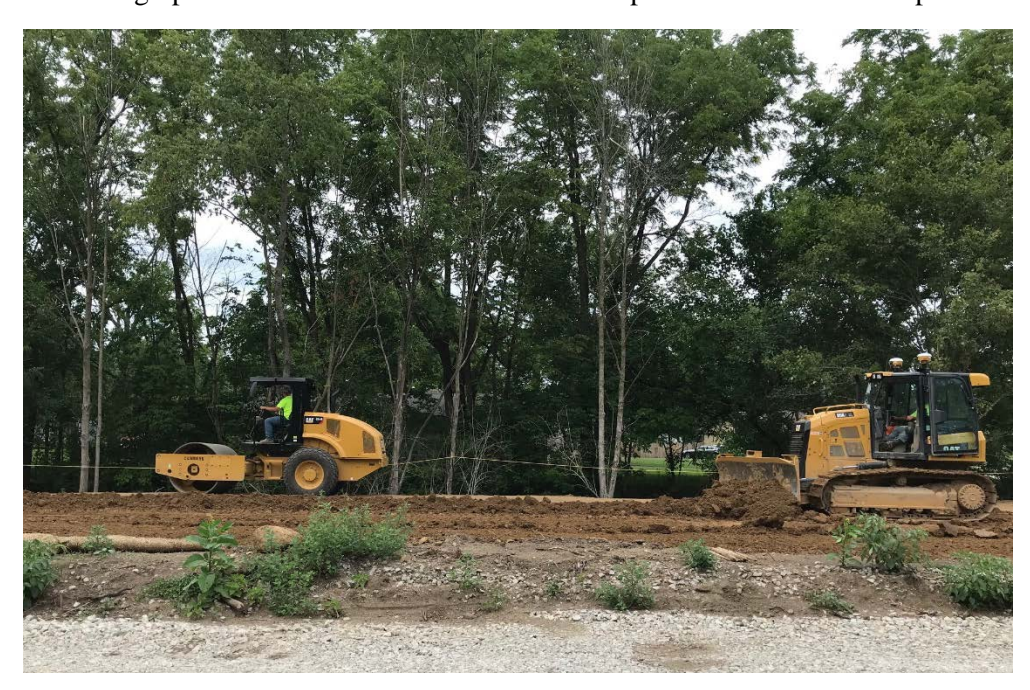
Photograph 2: Dust suppression of haul road with water