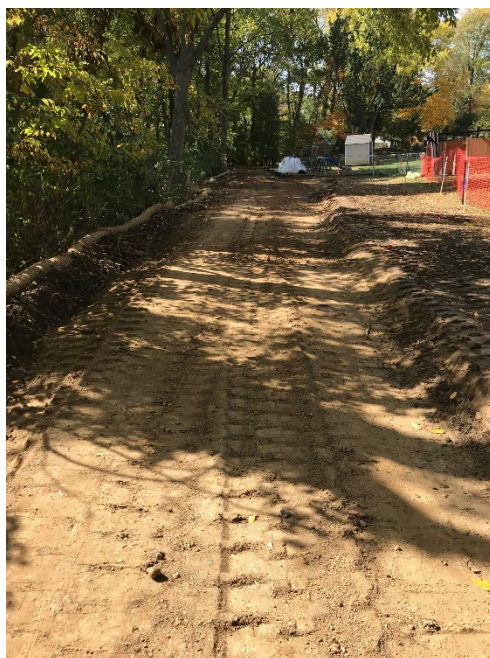
Photograph 2: Backfilling, in progress (view facing west)